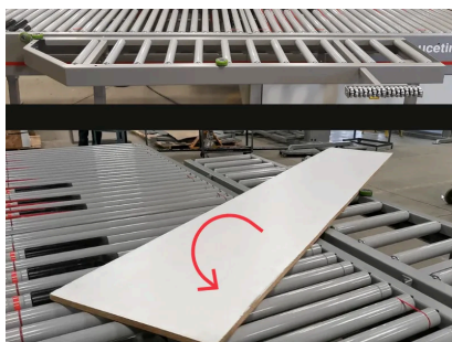
PT-90 PANEL TURNER